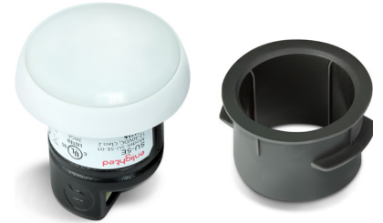
Hard Ceiling Mount Carrier